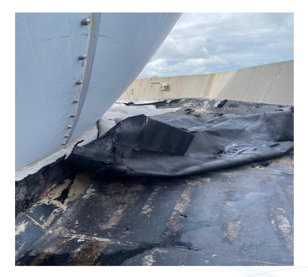
Figure 1: Example of an area that requires refurbishment.