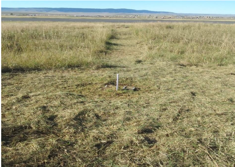
Figure 1: Example of a VDF and VOR test points that require paving.