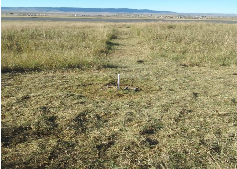
Figure 1: Example of a VDF and VOR test points that require paving.