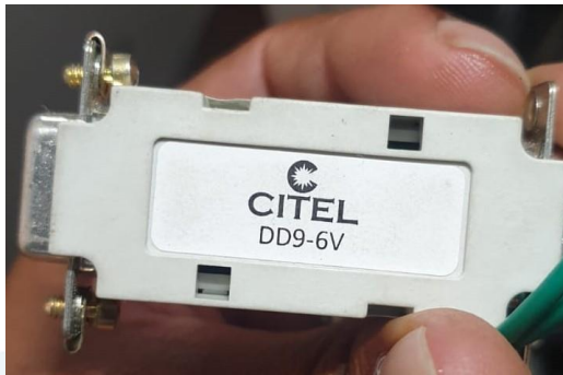
SURGE PROTECTOR DB9-6V