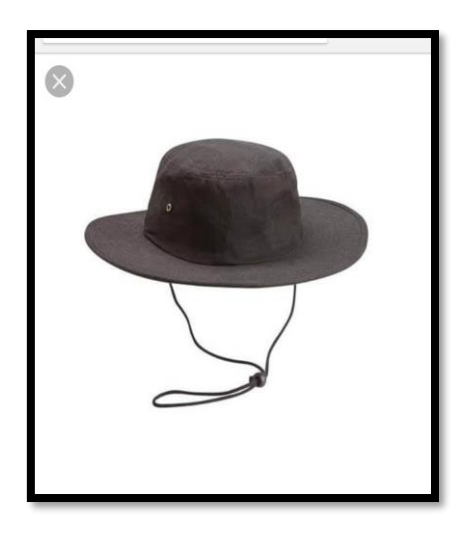
Cricket Hat -Navy