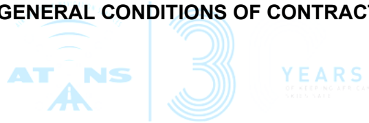
TABLE OF CLAUSES