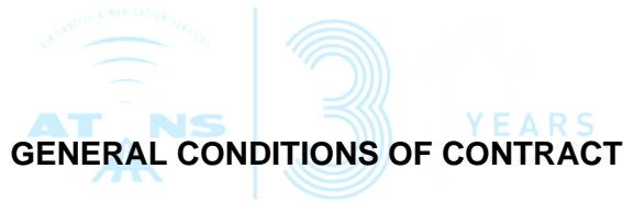
TABLE OF CLAUSES