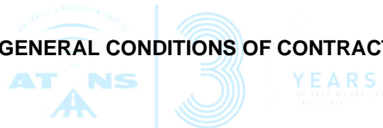
TABLE OF CLAUSES