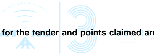
Table 1: Specific goals for the tender and points claimed are indicated per the table below.

Note to tenderers: The tenderer must indicate how they claim points for each preference point system.)