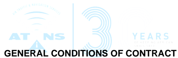
TABLE OF CLAUSES