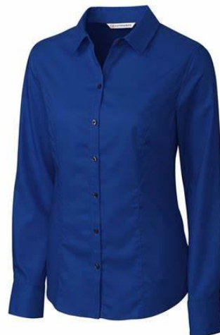
Men’s Long sleeve formal Shirt