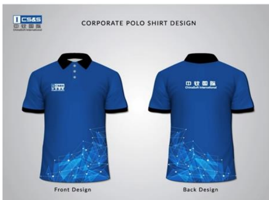
Branded/Embroidered Women's and Men's golf t-shirt