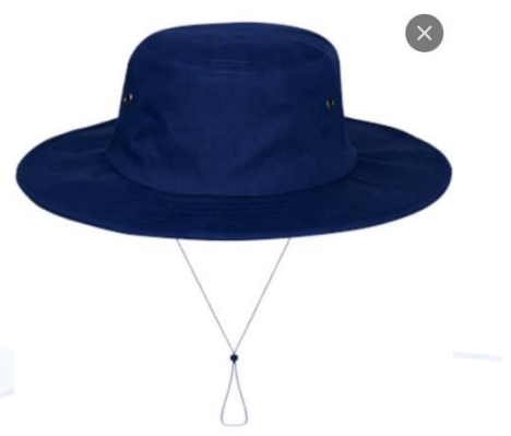
Branded ATNS cricket hats