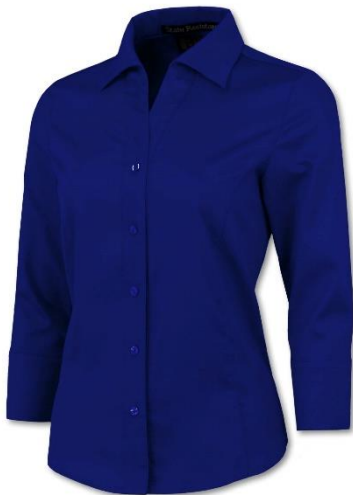
Women’s formal Shirt