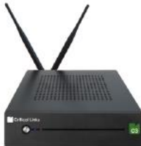
C3 Micro Cloud Screenshots