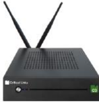
C3 Micro Cloud Screenshots