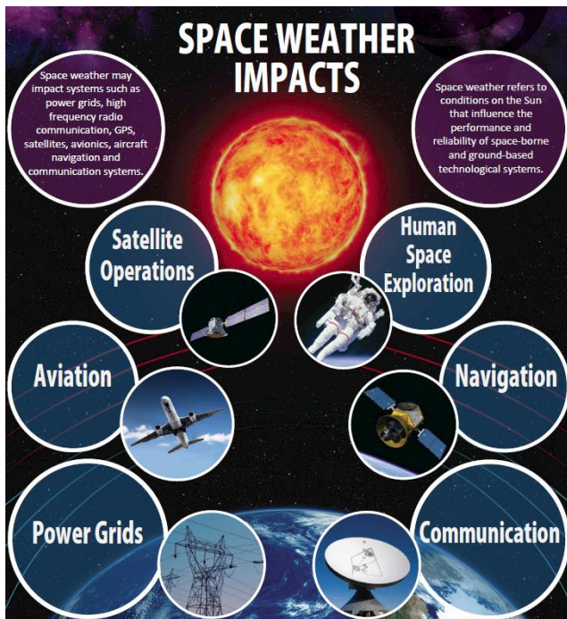
Figure 2: Aviation, as discussed in this policy brief, is just one of several sectors that are vulnerable to the impacts of space weather.

Space weather predictions and forecasts are useful capabilities which, depending on the accuracy, could affect the way space weather impacts are mitigated. Currently, it is extremely difficult to forecast earth directed solar events, such as solar flares and geomagnetic storms. However, research has provided techniques that are constantly improving our ability to forecast these events. For example, the arrival time of Coronal Mass Ejections (CMEs) can be forecast with an arrival time accuracy of approximately 6 – 8 hours. Global space weather teams are working together to improve the accuracy of forecasts and predictions of arrival times and impact severity. Appropriate instrumentation, such as the STEREO satellites, that enable the monitoring of the far side of the Sun, and the ACE satellite, are essential for providing this operational capability 2,3 .