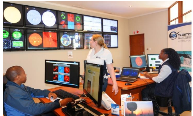
Figure 4: The SANSA Space Weather Centre provides valuable data, information and interpretation on the impacts of space weather.

the understanding and awareness of space weather within Africa, and (iii) provide a space weather operational service to government and industry users.