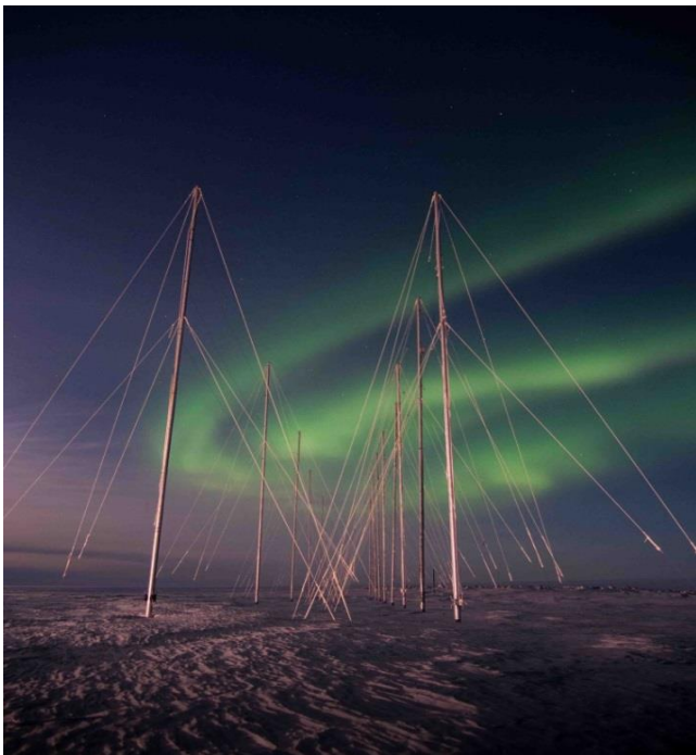
Figure 5: SANSA operates a wide suite of space monitoring instrumentation which provides valuable space weather data to scientists and forecasters on the state of the space environment.

Through the International Space Environment Service (ISES) and the South African Weather Service (SAWS), SANSA is representing South Africa on a number of expert groups that are developing the provisions required to meet this recommendation. It has been recommended that nations be ready to integrate space weather into the aviation sector by 2017.