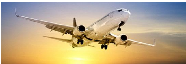
Figure 3: The aviation sector is extremely safety conscious and already has a safety standard into which space weather impacts can be incorporated.

The fourth primary risk from space weather for the aviation sector is radiation exposure to crew and passengers. The International Commission on Radiological Protection (ICRP) recommends effective dose limits over a 5 year average of 20 millisieverts (mSv) yr -1 with no more than 50 mSv in a single year for non-pregnant, occupationally exposed persons, and 1 mSv yr -1 for the general public. During an extreme solar event airborne crew and passengers could be exposed to an estimated additional dose of radiation up to 20 mSv at the worst-case. There is no practical way of forecasting this kind of event, or the impact, in time to mitigate effectively, as the high energy particles (which are the primary concern), arrive at the speed of light i.e. within 8 minutes. In addition, the costs associated with grounding aircraft and/or crew, and in diverting to alternative routes are significant. Several studies have been conducted on these effects to assess the most vulnerable scenarios. The primary conclusion of these studies indicate that on-board monitoring of radiation exposure and post-event analysis is required if mitigation and accurate forecasting is to become possible in the future 3,6,8,9,10 .