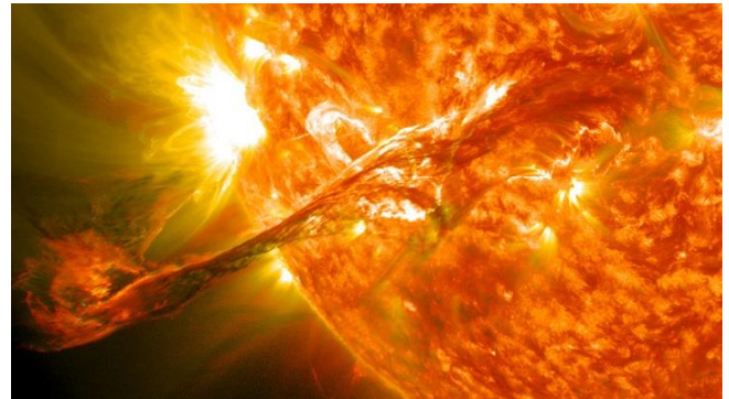
Figure 6: The Sun is the driver of space weather, therefore it is essential to constantly monitor solar activity to assess the potential impact on space and ground based technological systems.

These recommendations come from an understanding and awareness of the potential impacts of space weather on the aviation sector, and have been derived after national and international consultation. The international parties consulted included the UK Met Office, the Mullard Space Science Laboratory (MSSL) of the University College London, RAL Space based at the Rutherford Appleton Laboratory in the UK, and the USA Space Weather Prediction Centre.